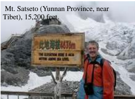
Mt. Satseto (Yunnan Province, near Tibet), 15,200 feet.

U.S. Freedom of Information Act, environmental journalism and ethical issues facing the news media. He also directed journalism workshops for Chinese journalists in Beijing and Shanghai and appeared on both Chinese television and radio stations. He was accompanied by his wife and their two teen-aged sons. Highlights at www.faculty.jrn.msu.edu/detjenchina/